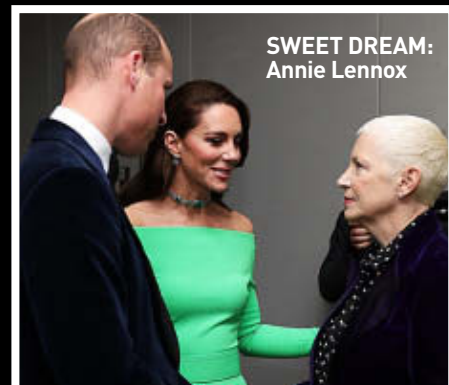
SWEET DREAM: Annie Lennox

DAVID Beckham greets the Princess of Wales with a kiss as her US tour ends on a high note. Kate and William hosted the Earthshot Prize gala – launched by the prince to fund green projects. After a week of turmoil, the royal couple received a standing ovation in Boston on Friday. Kate, 40, paired a green dress with a diamond and emerald choker that belonged to her late mother-in-law, Diana. Guests – who included Ellie Goulding, Annie Lennox and Rami Malek – arrived in hybrid vehicles and walked down a green carpet. And headliner Billie Eilish performed My Future remotely from her LA home. British firm Notpla, which makes biodegradable packaging out of seaweed, was among five winners to receive a £1million grant. A start-up that builds biomass stoves in Africa and a "greenhouse-in-a-box" firm boosting harvests in India were also lauded.