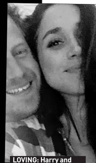
LOVING: Harry and Meg in Netflix trailer

"At the same time, it can be possible to feel guilty for having fun without our parents but I'm here to assure you that our parents always want us to have fun. Go out there, have the best time and merry Christmas."