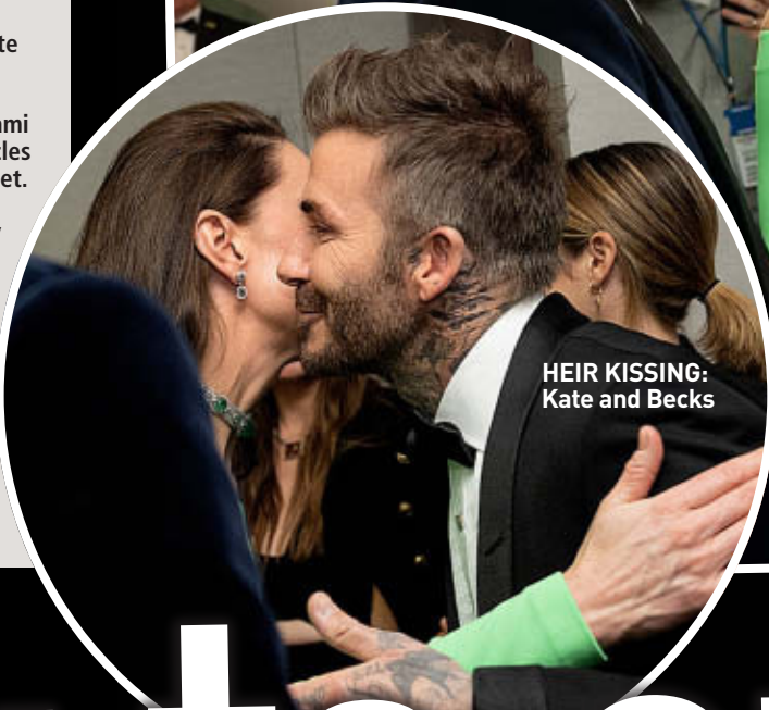
HEIR KISSING: Kate and Becks