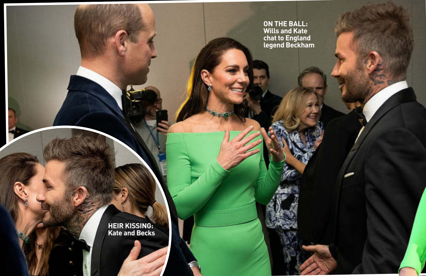
ON THE BALL: Wills and Kate chat to England legend Beckham

DAVID Beckham greets the Princess of Wales with a kiss as her US tour ends on a high note. Kate and William hosted the Earthshot Prize gala – launched by the prince to fund green projects. After a week of turmoil, the royal couple received a standing ovation in Boston on Friday. Kate, 40, paired a green dress with a diamond and emerald choker that belonged to her late mother-in-law, Diana. Guests – who included Ellie Goulding, Annie Lennox and Rami Malek – arrived in hybrid vehicles and walked down a green carpet. And headliner Billie Eilish performed My Future remotely from her LA home. British firm Notpla, which makes biodegradable packaging out of seaweed, was among five winners to receive a £1million grant. A start-up that builds biomass stoves in Africa and a "greenhouse-in-a-box" firm boosting harvests in India were also lauded.